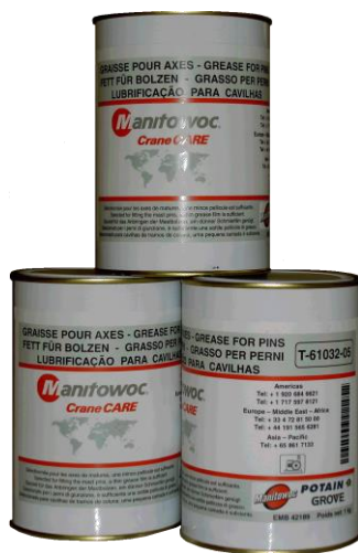
T-61032-05 Can 1 kg