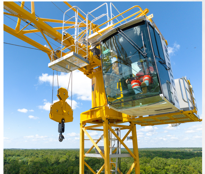
SM/DM Quick Lock™