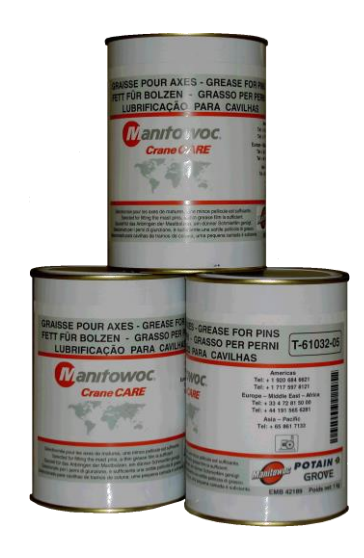
T-61032-05 Can 1 kg